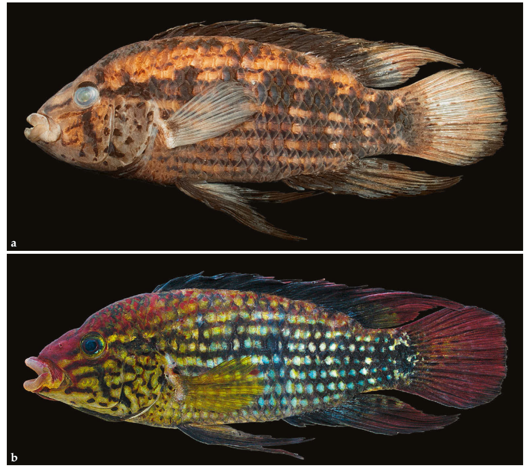
Fig. 1. Apistogramma kullanderi, MZUSP 115057, holotype, 79.7 mm SL, adult, brooding male; Brazil: Pará: tributary of rio Curuá, rio Xingu basin; a, preserved; and b, alive, just after capture.

and other dwarf cichlids by Römer (2006).