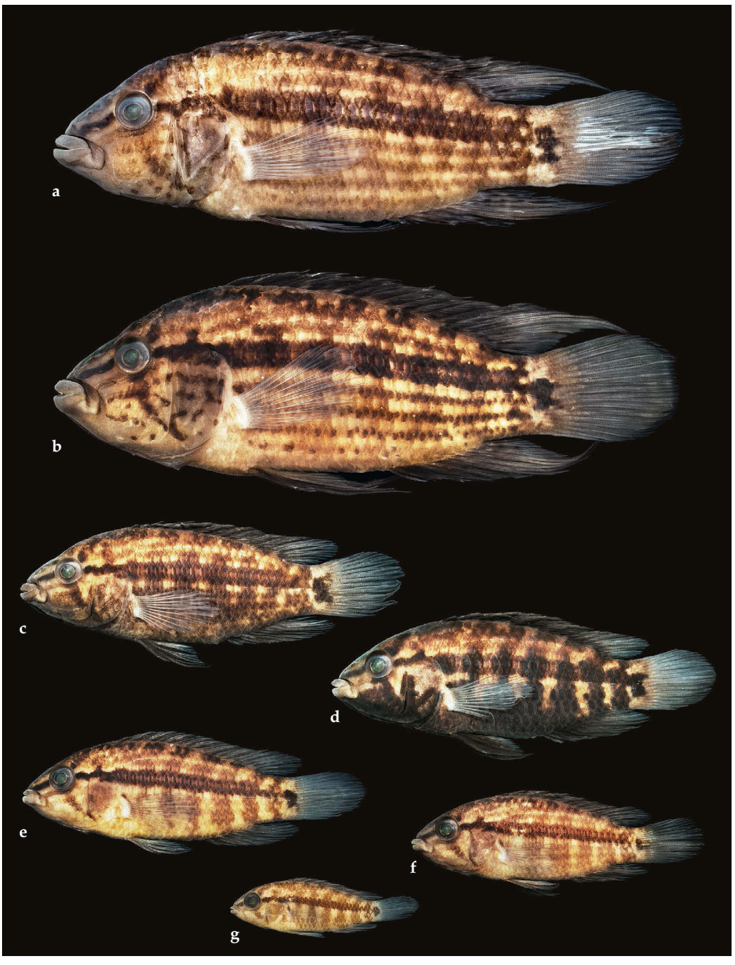
Fig. 3. Apistogramma kullanderi , all MZUSP 101380, paratypes; Brazil: Pará: tributary of rio Curuá, rio Xingu basin; a , 70.7 mm SL, adult male, intermediate stage of maturation; b , 70.5 mm SL, adult brooding male; c , 42.4 mm SL, adult female, intermediate stage of maturation; d , 42.3 mm SL, brooding female; e , 37.8 mm SL, unsexed subadult; f , 31.8 mm SL, unsexed juvenile; and g , 20.4 mm SL, unsexed juvenile.