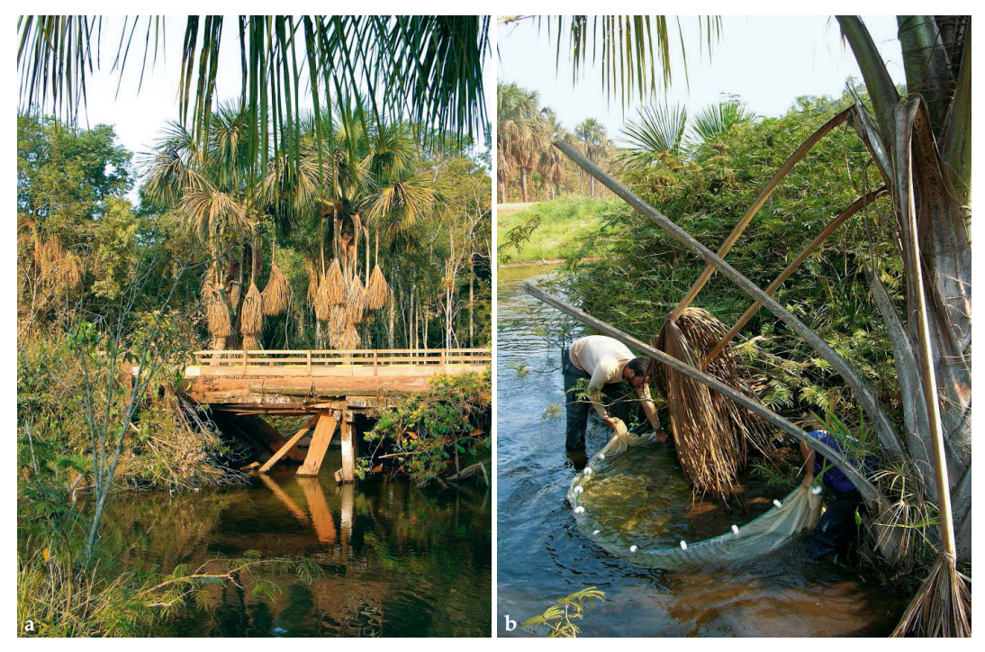
Fig. 8. Type locality of Apistogramma kullanderi , unnamed tributary of rio Curuá (Iriri drainage), at BR163, bridge, 29 October 2007.

greater contrast between darker stripes and paler ground color, and with two additional stripes evident (i.e., twelve overall), one from gill cover to anal-fin origin and second shorter stripe from gill cover to pelvic-fin origin.