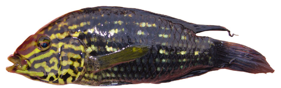
Fig. 6. Apistogramma kullanderi, MZUSP 97584, 76.0 mm SL; Brazil: Pará: tributary of rio Curuá, rio Xingu basin; mature male, live specimen photographed just after capture; dark coloration perhaps induced by stress during capture and/or subsequent photography.